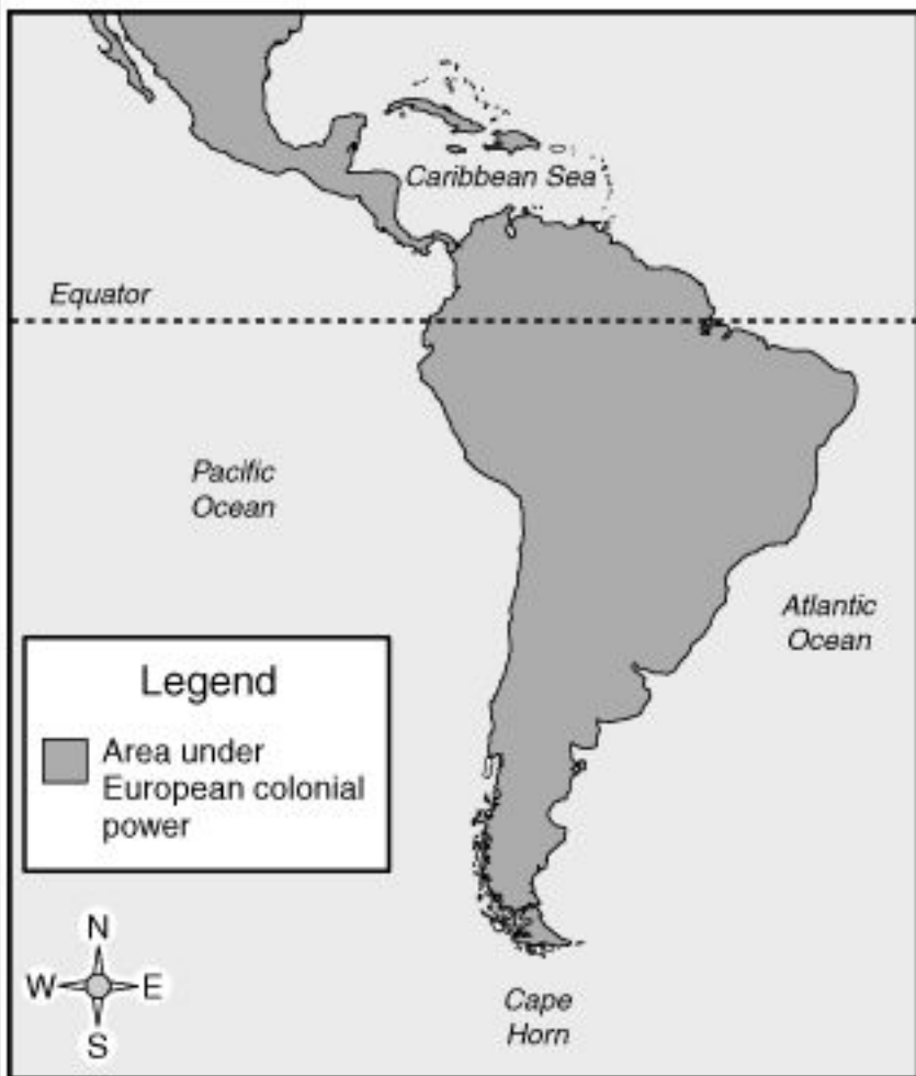
Latin America, 1800